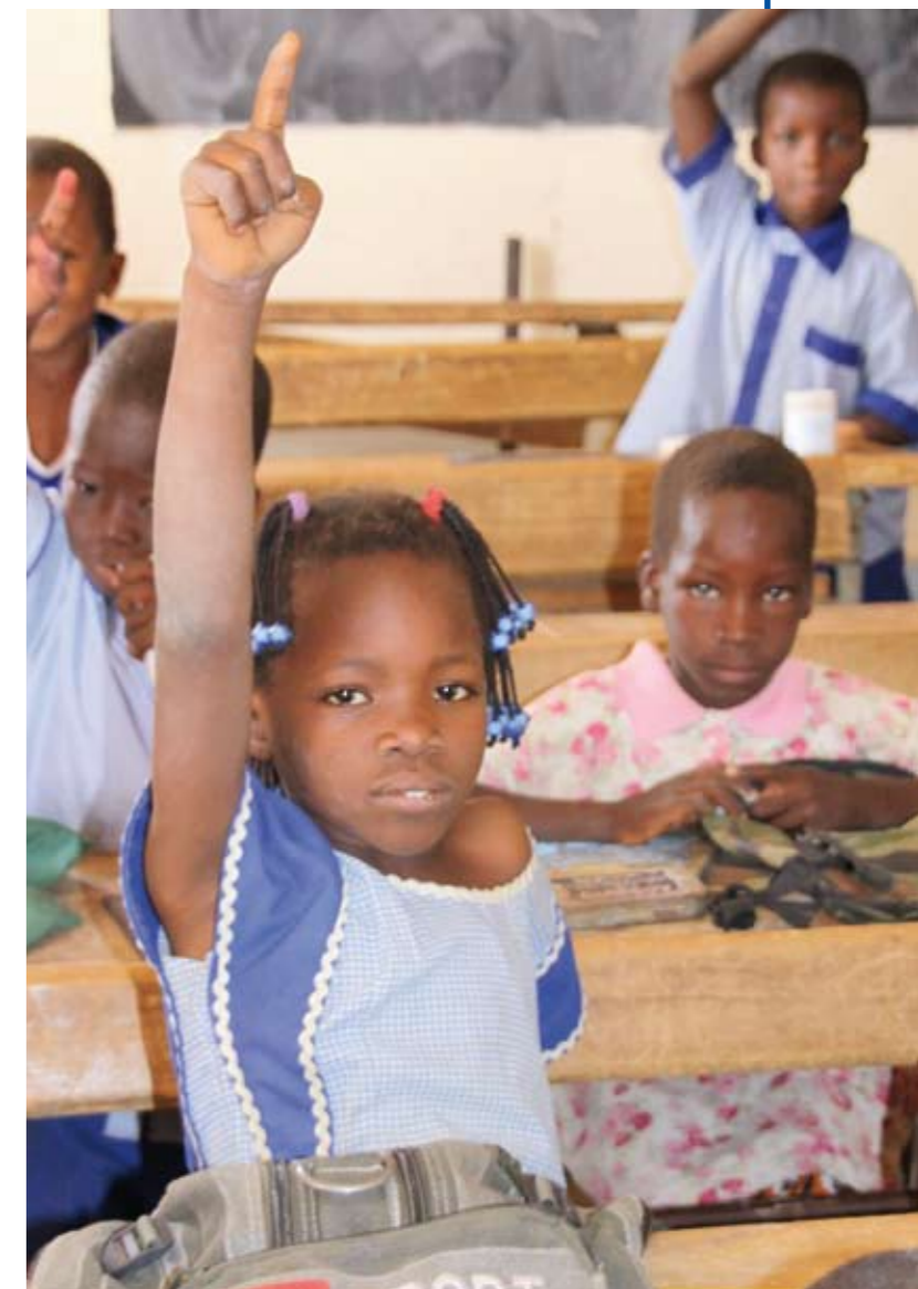
Children with disabilities should attend mainstream schools and realise their right to education.

Successful inclusive education uses a child-centred pedagogy, to the benefit of all children attending school. Among the initiatives supported by LIGHT FOR THE WORLD are pilot schools for inclusive education, training programmes for teachers in special education, resource centres to provide assistance to educational institutions, and the provision of specific teaching materials such as Braille books. In Burkina Faso and Pakistan, LIGHT FOR THE WORLD is engaged in a policy dialogue with national ministries and regional authorities to promote inclusive education. On an international level, LIGHT FOR THE WORLD is a member of the Global Campaign for Education and the initiative 'Education for All – Visually Impaired'.