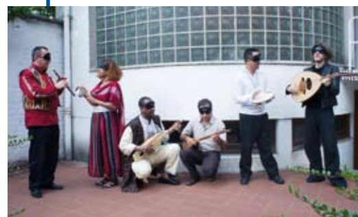
Famous musicians from the Belgian world music scene went on tour all over the country to play their music in absolute dark to raise awareness for blind people and their needs.