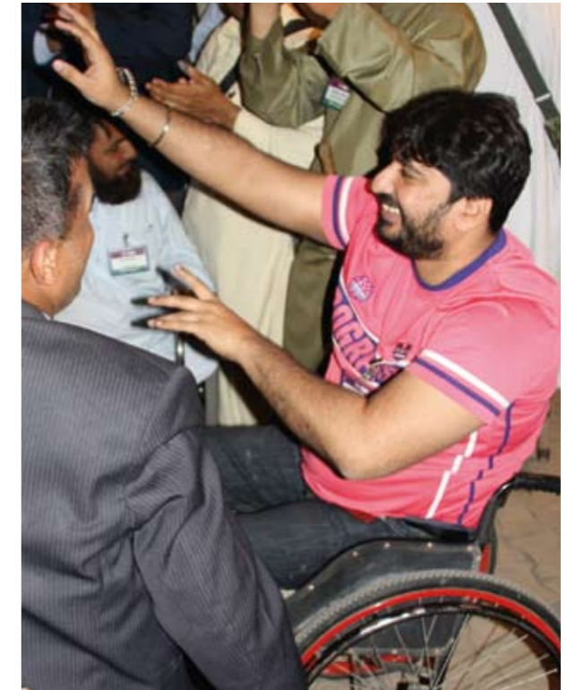
Government Representatives and persons with disabilities celebrating the foundation of Pakistan's „DPOs Council“.

The challenge remains to sustain the momentum of the last few years and to integrate an inclusive development approach into the new 'EU External Action Service' that is currently being set in line with the Lisbon Treaty. To be truly impactful on the lives of persons with disabilities, all of our advocacy work at the EU and international levels needs to be mirrored at partner country level.