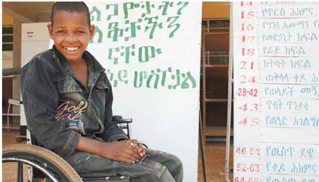
Persons with disabilities must be included in the Millennium Development Goals.

Since the Millennium Declaration in 2000, the international community has placed the Millennium Development Goals (MDGs) at the centre of its attempts to lift more than a billion people out of absolute poverty by eradicating extreme poverty and hunger, achieving universal primary education, promoting gender equality and the empowerment of women, reducing child mortality, improving maternal health, combating HIV/AIDS, malaria and other diseases, ensuring environmental sustainability and developing a global partnership for development.