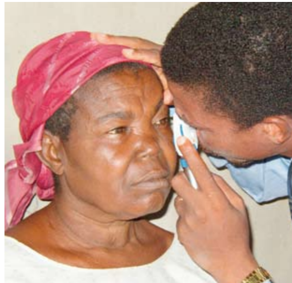
Eye screening in Nigeria: The sooner illnesses are identified the better they are treatable.

At both the disability hospital of CCBRT in Dar es Salaam and the Kilimanjaro Christian Medical Centre in Moshi large numbers of children with cataract and other blinding eye diseases are finally getting access to the high-quality treatment they need. In Moshi alone, 128 children with cataract had their sight restored in 2010. Our systems for identifying children with cataract in their communities and providing treatment and follow up rehabilitation developed in collaboration with the Kilimanjaro Centre for Community Ophthalmology not only benefit the children of Tanzania, but have become a model for the whole of sub-Saharan Africa.