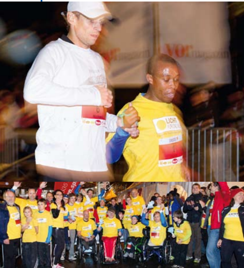
Vienna Night Run is barrier-free. Many wheelchair users from various countries took the chance to participate